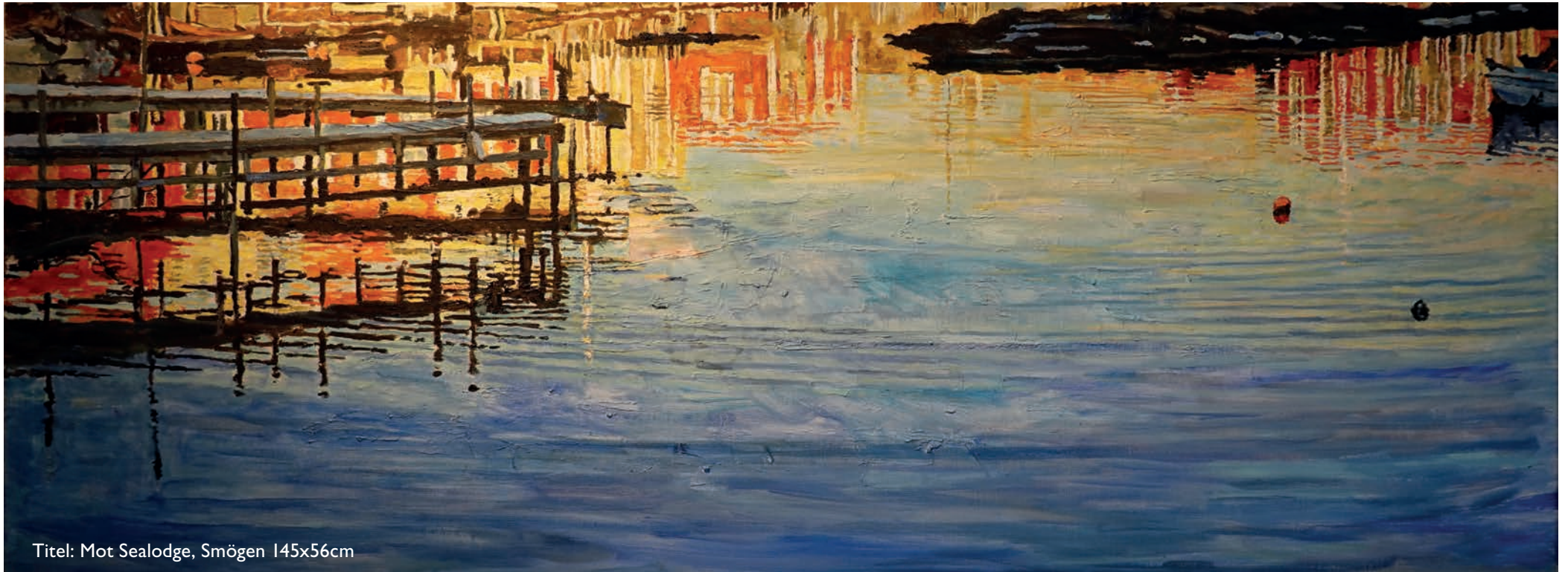
Titel: Mot Sealodge, Smögen 145x56cm