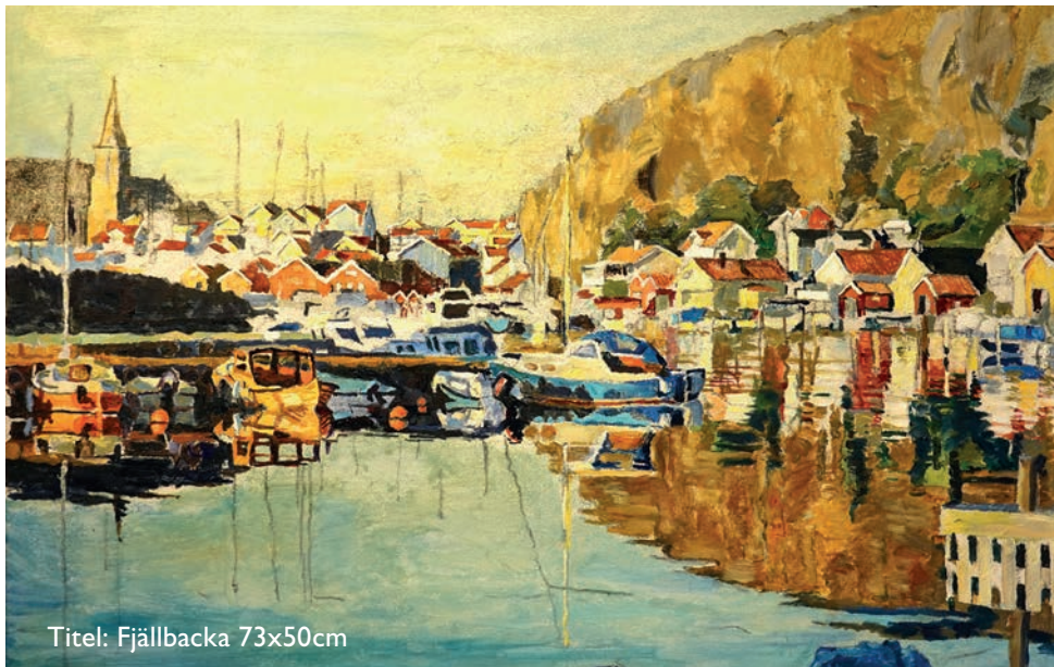
Titel: Fjällbacka 73x50cm