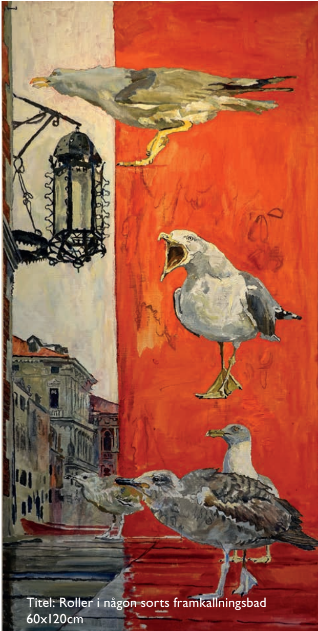
Titel: Roller i någon sorts framkallningsbad 60x120cm